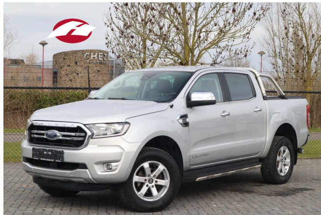
Ford Ranger 2.0 | LIMITED | 4X4 | AUTO | DOUBLE CAB