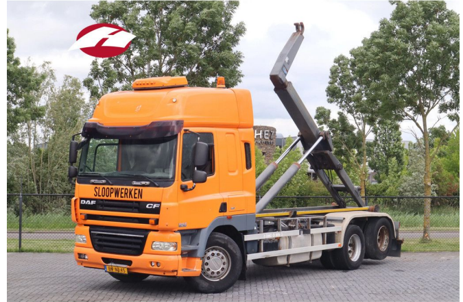
DAF CF 85.360 | 6X2 | VDL HOOKLIFT | EURO 5